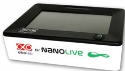
Figure 3: Top Stage Incubator Temperature Controller

Start the microscope and the computer, place the chamber on the microscope stage (if you just got it, remove the blue stickers within the removable part of the chamber that might impact the flatness of your field of view), connect it properly (see manual and set up video: http://nanolive.ch/supporting-material/#setup-incubator ) and place the lid. Switch the controller on, and set the temperature to 38 degrees C°.