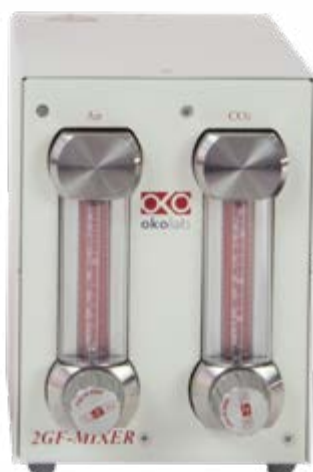
Figure 4: Manual Air / CO 2 Mixer

We recommend setting the CO 2 to 8-10% if you are using DMEM or other medium with carbonate buffers.