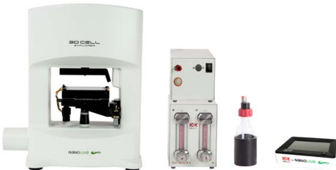
Figure 2: 3D Cell Explorer set up with its top stage incubator

Secondly, you will need the Nanolive's top stage incubator equipment. This includes the top stage incubation chamber, a controller pad, and a humidity system. We recommend using our CO 2 mixer and air pump that will ensure a proper control of CO 2 proportions and will help you save some money on compressed air. Learn how to set up your Nanolive Top Stage Incubator here: http://nanolive.ch/supporting-material/#setup-incubator .